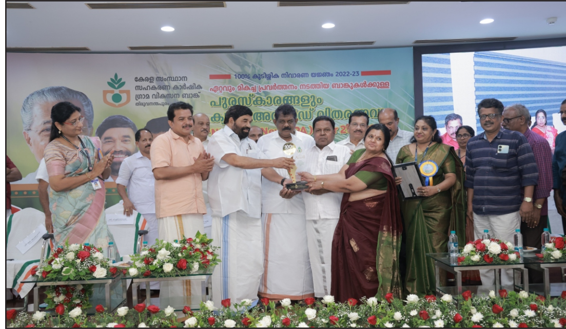
Hon'ble Minister for Co-operation Sri. V.N. Vasavan distributing Best Performance Award to Ottappalam PCARDB in "100% Recovery Campaign 2022-23" on 07-08-2023 at Jawahar Sahakarana Bhavan, Thiruvananthapuram