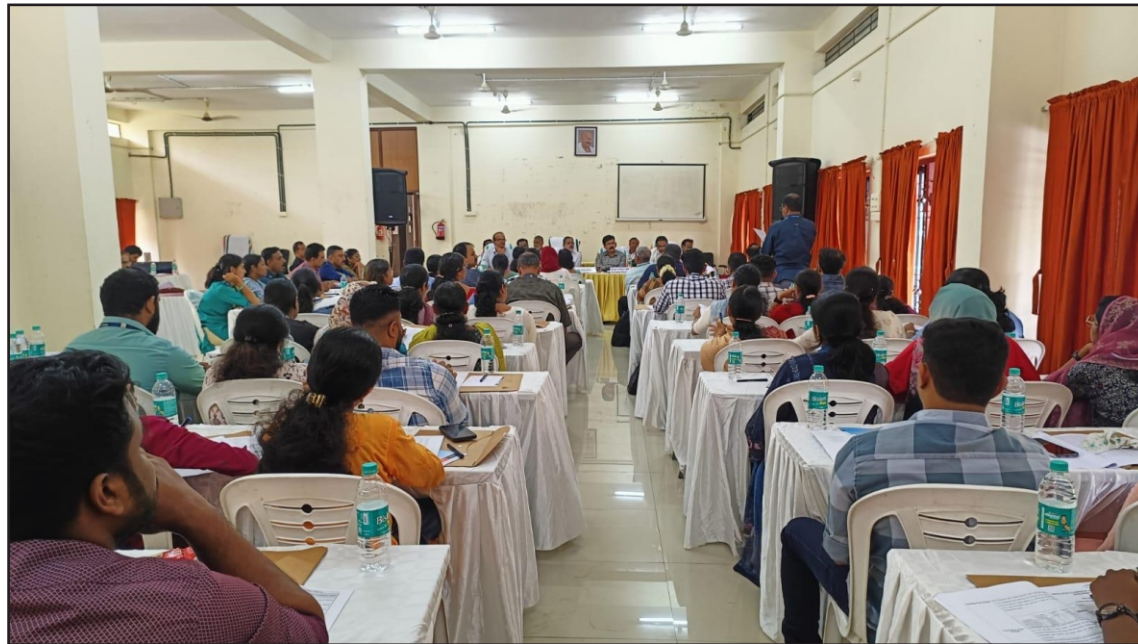
Regional Managers' Conference at ITM on 02.02.2024